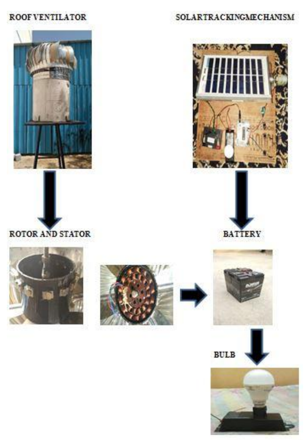
Fig.1 Working of Hybrid Power Generation

light and change its direction according to sun's position and it is connected to the battery. The stored electricity in the battery is used to light up a bulb.